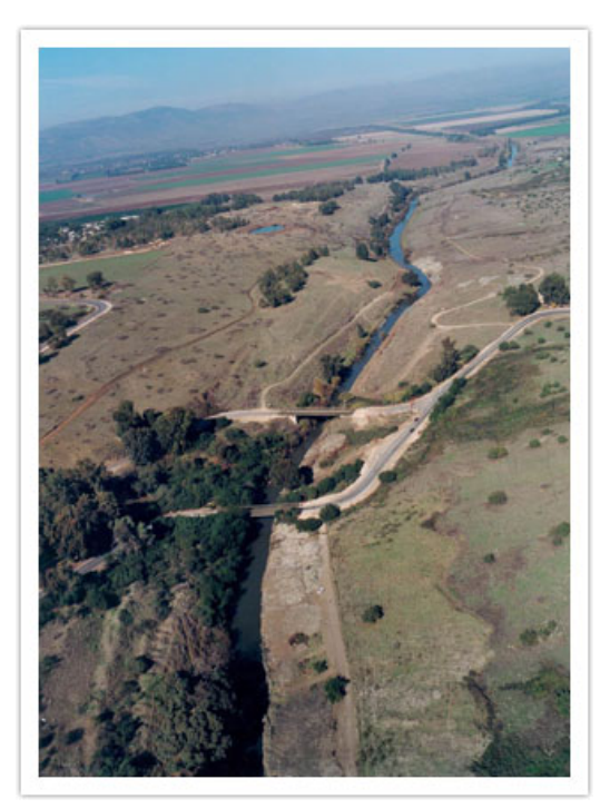
Photo: Aerial view looking north toward the Bnot Ya'akov Bridge and the Hula Valley.

At the prehistoric archeological site at the Bnot Ya'akov Bridge in the southern Hula Valley of Northern Israel, excavations in 2009 revealed that Lower Paleolithic humans may have lived in the area as early as 790,000 years ago. Archeologists from the Hebrew University of Jerusalem described a layer of early stone-age culture at the excavation site, where numerous flint & stone tools, wood used for fuel, animal bones and plant remains were found. Archeologists claimed that such artifacts provided evidence of "advanced human behavior" more than half a million years earlier than has been previously estimated. [6]