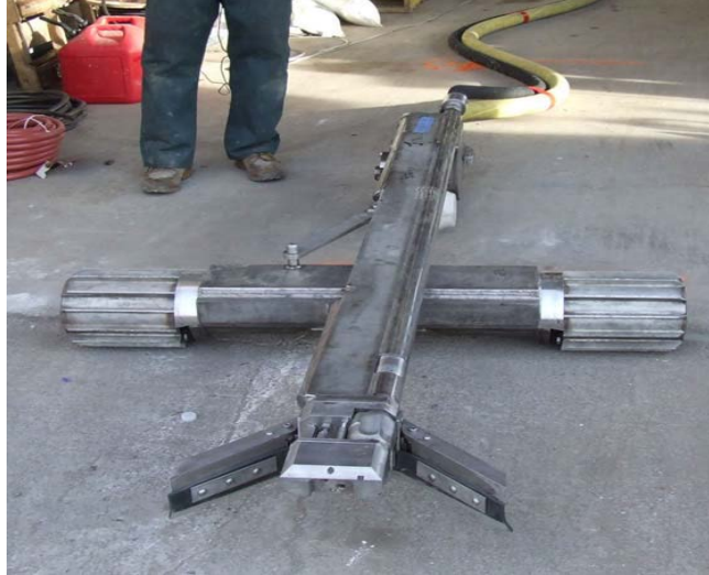
Fig. 1. Mantis Device

Hanford has also adapted a FoldTrack device, originally used for cleaning sludges in oil tankers and conveyance equipment, for use inside of unobstructed tanks. Similar in concept to the Mantis, the FoldTrack mechanically breaks up chunks of waste, moving solids to the pump inlet. The apparatus can collapse, i.e. fold to fit through tank risers. The Foldtrack has nozzles to spray high-pressure water directly at the waste.