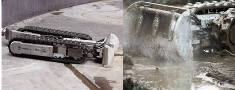
Fig. 2 FoldTrack

Hanford has also adapted a FoldTrack device, originally used for cleaning sludges in oil tankers and conveyance equipment, for use inside of unobstructed tanks. Similar in concept to the Mantis, the FoldTrack mechanically breaks up chunks of waste, moving solids to the pump inlet. The apparatus can collapse, i.e. fold to fit through tank risers. The Foldtrack has nozzles to spray high-pressure water directly at the waste.