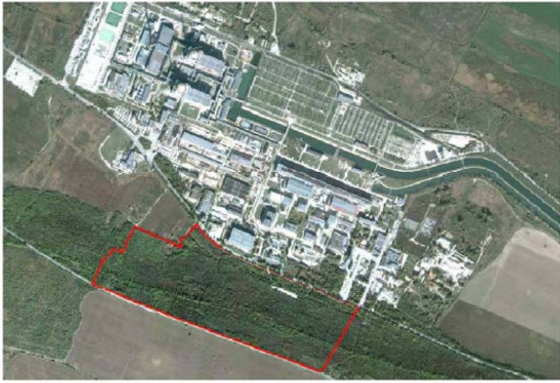
Figure 1: Radiana Site where the NDF will be constructed in relationship to the KNPP

The NDF is designed to receive, manage and dispose of waste packages arising from the decommissioning of KNPP Units 1 to 4 and operational waste from KNPP Units 5 and 6 consistent with KIDSF purposes. The NDF will receive preconditioned radioactive waste contained in 1.95 m on a side, cubic, reinforced concrete waste packages. The waste packages will be disposed of in the reinforced concrete disposal cells. The 22 disposal cells to be completed as part of Phase 1 will be arranged in two parallel rows of 11 disposal cells each. The external dimensions of the disposal cells are 20.15 m long \times 17.05 m wide and 9.45 high with a minimal wall thickness of 0.5 m. Each disposal cell will have three chambers for waste package emplacement. The disposal cells are designed to contain the waste for a period of at least 300 years after closure. Performance of the disposal cells waste retention capability will be confirmed throughout this period by periodic monitoring of potential infiltrating water collected in a specially designed drainage system installed in the Infiltration Control Network Galleries, which provides monitoring access beneath each line of disposal cells.