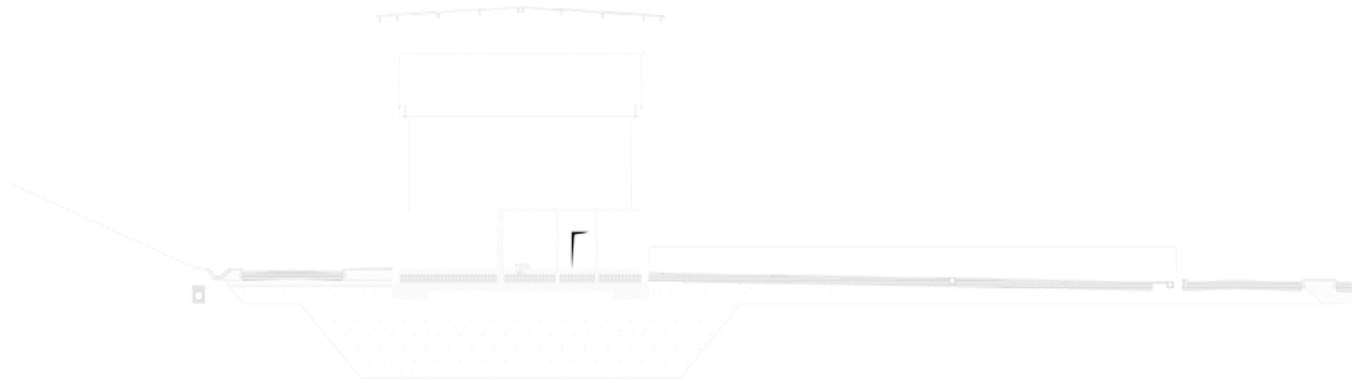
Figure 5: Cross Section Showing the Loess-Cement Cushion - WRBS Building

Therefore the exterior walls as well as the interior shield walls provided for the building shall be constructed in a fashion similar to the disposal cells. Walls with radiological safety functions shall be constructed as 0.50 m thick reinforced concrete structures to provide radiation protection to the operational workers, the public and the environment. The building will be equipped similarly as the mobile roofs with an overhead crane to move waste packages within the building.