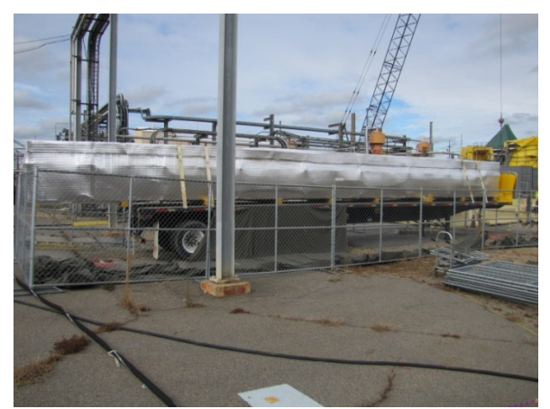
Fig. 8. SMP in long term cold weather storage

for another 6 years at a minimum, but these pumps required removal to provide tank access during the grouting phase. To date, no SLP has been required to be stored outside of a waste tank after use. However, contamination and shielding controls would be similar. Also, long shafted pumps require routine shaft rotation not available within storage containers.