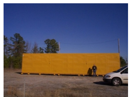
Fig. 7. SMP Pump Transport Container