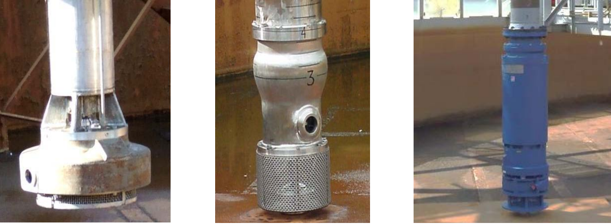
Fig. 1. SLP