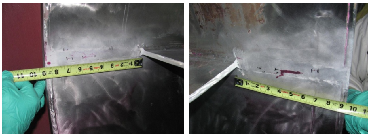
Fig. 6. Shell ID after pass partition plate removal.

program. Repair consisted of removing the defects by grinding and defect removal was confirmed by PT. Once confirmed, the excavated area was prepared (with a groove sufficient to accommodate a stringer bead(s)) and welded using the Gas Tungsten Arc Welding (GTAW) process. Care was exercised to ensure the shell was restored to its original thickness. Through-wall defects were welded from both the interior and exterior sides of the shell.