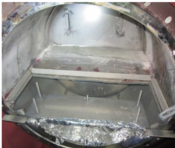
Fig. 5. Section of pass partition plate removed – leaving a 3/4-in piece along the

A section of the plate, measuring approximately 230 mm deep by 890 mm wide, was removed using a plasma arc cutting torch. The cut line on the plate running parallel to the shell axis was placed approximately 20 mm inward from the shell – see Figure 5. This was done to avoid any potential impact (wall thinning) on the shell thickness. The remaining piece of plate and the two attachment fillet welds were completely removed by grinding. The shell ID surface was now fully accessible for evaluation and was examined (on both sides of the shell) by VT and PT to establish the extent of cracking – see Figure 6. Visual examination revealed no indications of corrosion at the plate / shell interface. Liquid penetrant examination disclosed numerous linear indications on both the exterior and interior shell surfaces where the plate was attached to the shell.