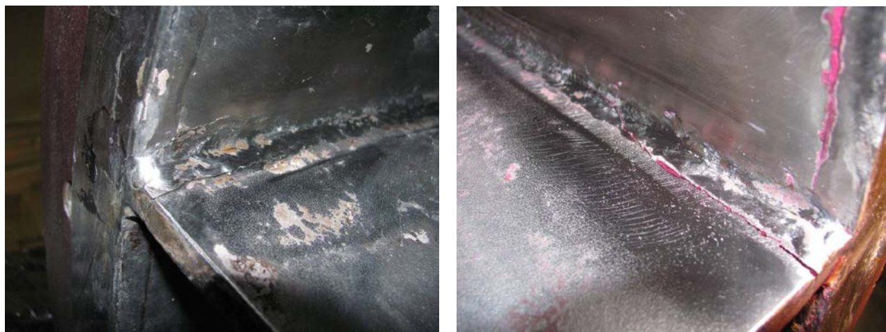
Fig. 2. Cracking at the shell / pass partition plate welds.

After discovery of the leak and removal of the insulation, location of the through-wall failure was identified (from the shell OD) to be approximately 76 mm from the channel blind flange on the west side and aligned with the fillet welds attaching the pass partition plate to the shell ID. The channel blind was removed to allow visual examination of the vessel ID. Initial examination revealed cracking on both sides of the