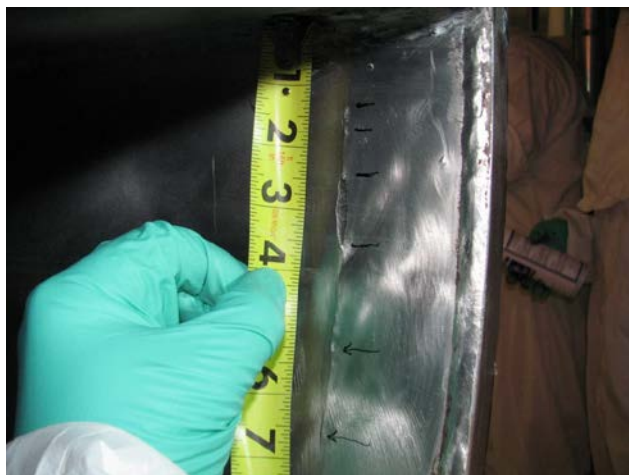
Fig. 3. Circumferential, linear indication – affected base metal.

To better assess the condition/integrity of the vessel shell, the ID in the area of interest was subjected to a rigorous cleaning. Visual examination was again performed, followed by Liquid Penetrant (PT) examination to determine the extent of the indications open to the surface. Ultrasonic Examination (UT) was performed from the OD to assess the shell condition (wall thinning, if any) at the partition plate / shell ID interface between the two fillet welds. UT results indicated no significant wall thinning or loss of material from the ID. The full extent of cracking however could not be determined without removal of the partition plate at the shell ID; this was done and is discussed below.