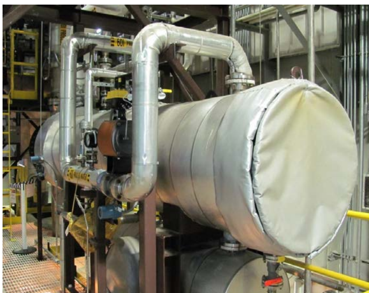
Fig. 1. Overall view of the ETF Heat Exchanger – repair area is at the far end.

The vessel, shown in Figure 1, is a two pass shell and tube heat exchanger with an outside diameter of 914 mm and a length of just under 5.5 m. Steam on the shell side of the vessel transfers heat to chemically and radioactively contaminated brine on the tube side. Solids in the boiling brine stream are concentrated as it is pumped through the vessel via an axial flow recirculation pump at about 455 l/sec. The brine side of the vessel, including the tubes, is constructed from Inconel Alloy 625 (ASME SB-443 625), and the steam side is constructed from 304L stainless steel.