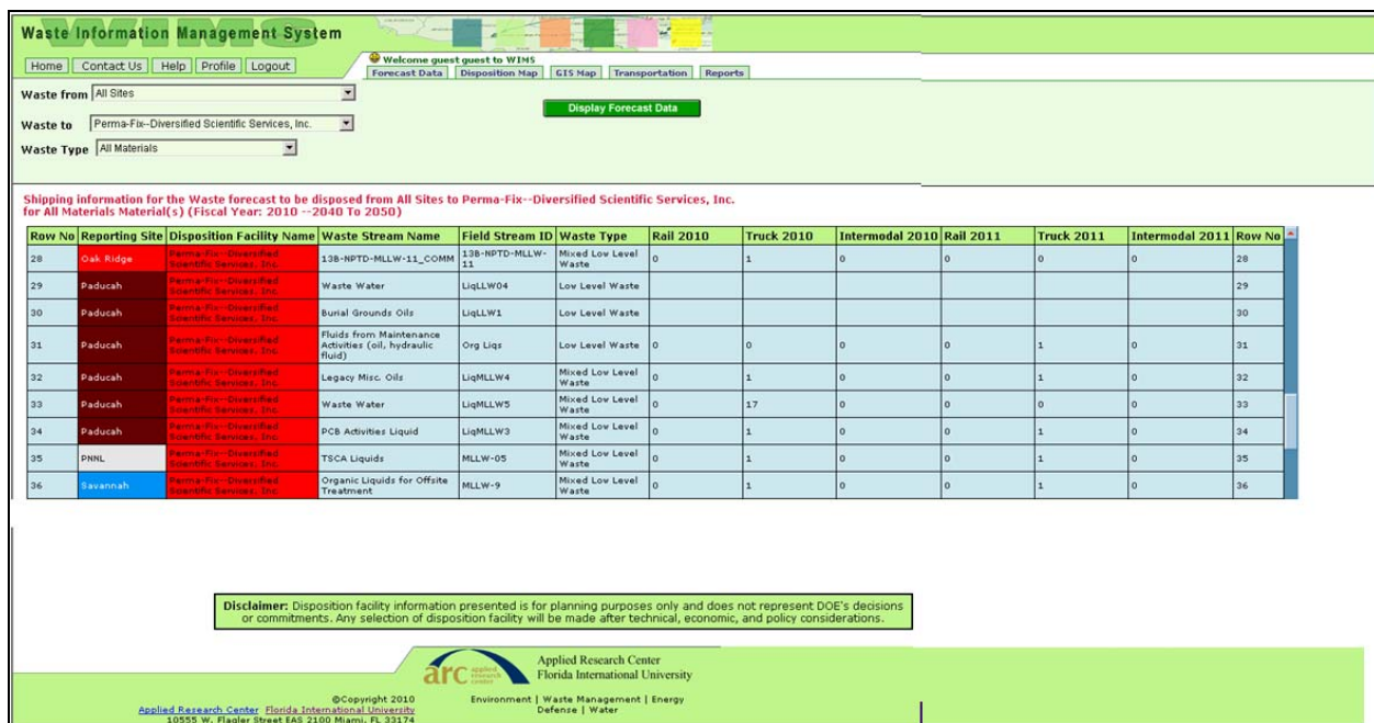
Fig. 4. The transportation forecast data screenshot displays a sample of the waste forecasted to be sent to Perma Fix DSSI, for disposal from all DOE sites in numbers of rail, truck and intermodal shipments.