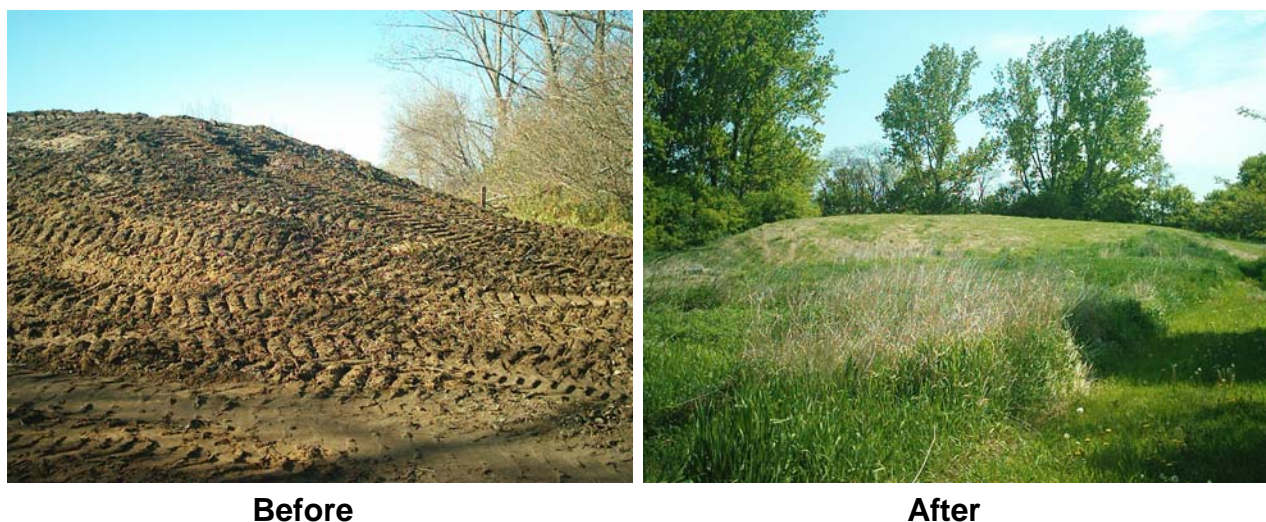
Fig. 4. Contoured surface of above ground storage mound before and after seeding with grass.

An elevation survey of the top of the waste fill within the contaminated area was carried out by Golder on October 27, 2009. The placement of final cover soil over the waste containment area commenced on October 29, 2009. The cover soil material consisted of silty fine sand. Approximately 1,250 m 3 of the cover soil was placed to a minimum thickness of 1 m over the waste and graded to provide surface drainage. Approximately 190 m 3 of topsoil stripped from the original cover was then placed to a thickness of 0.3 m overtop the silty fine sand cover soil. A survey of the top of the final cover was carried out by Golder on November 2, 2009. The cover placement was completed on this same date. The surface of the excavation area and storage mound were seeded with grass in the spring of 2010, as depicted in Figure 4.