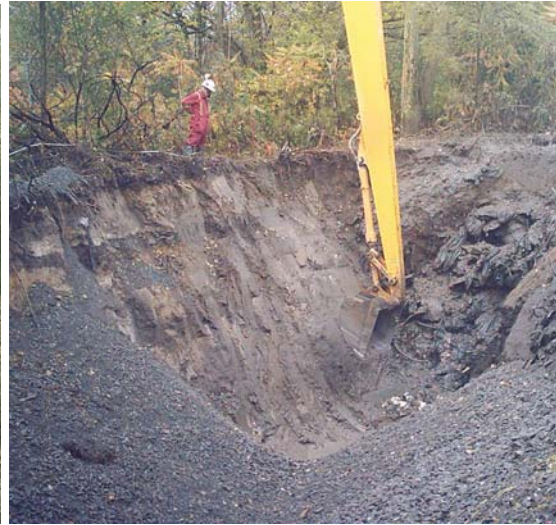
excavation in progress