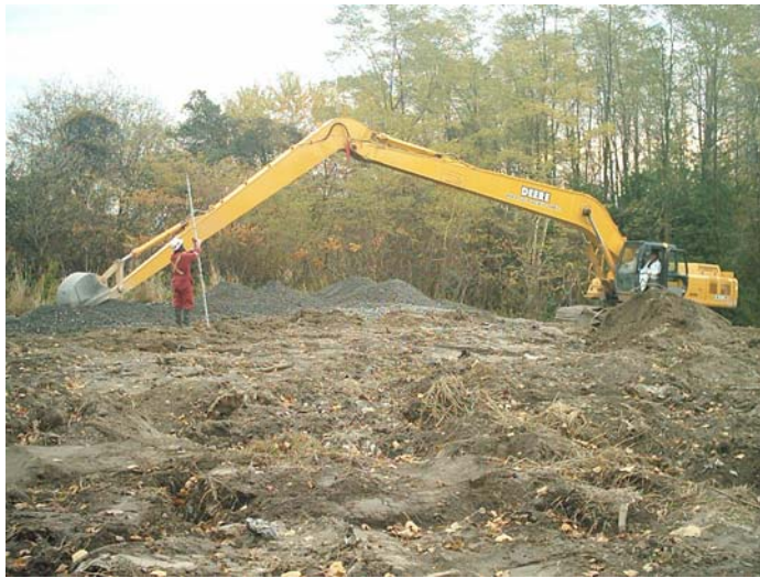
specialized extended boom excavator

In total, approximately 800 m 3 of buried waste material was removed, consisting of but not limited to filled garbage bags, drums at the upper portion of the trench and calcium fluoride at the lower portion. The excavation was carried out using an extended boom (John Deere Long Reach 330C LC) excavator depicted in Figure 2. This type of excavator provided a reach of approximately 18.3 m. The excavator was positioned at a safe distance away from the north crest of the excavation slope. The native soil wedge between the waste excavation and the erosion scarp was left in place.