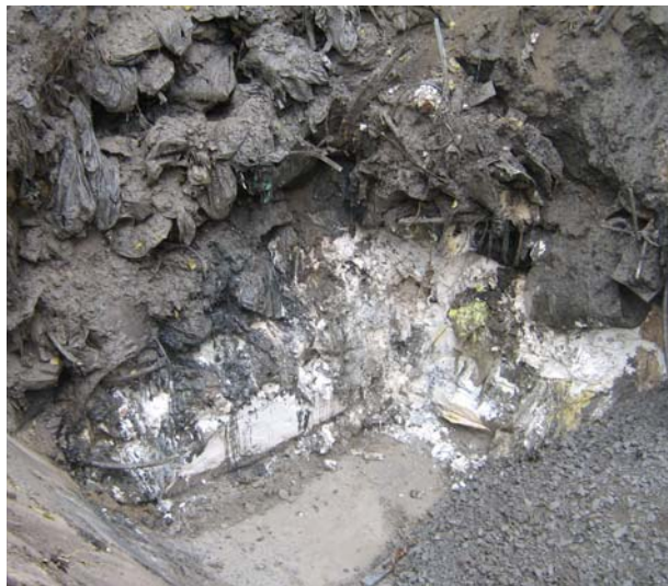
white calcium fluoride