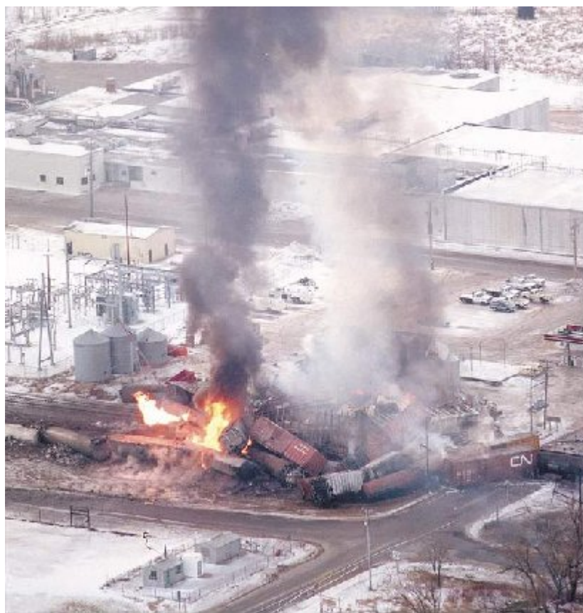
Fig. 1. Photograph of derailment and fire at Weyauwega, Wisconsin

In March of 1996, 37 cars of a Wisconsin Central Railroad train derailed at a road crossing in Weyauwega, Wisconsin. Figure 1 shows a photograph taken at the time of the accident.