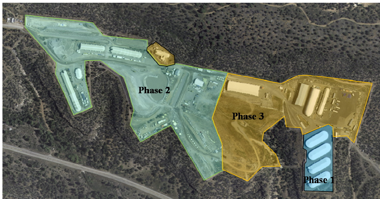
Fig. 1. Picture of Area G, showing the three phase closure of Material Disposition Area G.

To facilitate removal of TRU waste from MDA G, a number of process lines will be developed to support the time line. The process lines and the key planning considerations for each are shown in Figure 2. Process lines will be designed as temporary capabilities, for specific waste streams and phased into operations in accordance with the LANS TRU acceleration strategy. Capability will include drum processing and drum venting, box repackaging and size reduction, and retrieval operations.