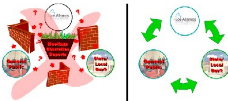
Fig. 2. On the left, the walls illustrate the lack of data sharing and interconnectivity between the individual project management tools used by different stakeholders. Meetings, charrettes, reports, conference calls are all used to overcome the barriers between the information systems of different stakeholders that cause data to be “thrown over the wall”, after which the agency in question asserts that they have provided information. The diagram on the right symbolizes the interconnectivity that results from full implementation of parametric project management tools.

The paper describes a holistic project management systems solution that adheres to four basic design principles: full and easy integration with each user group's typical daily work process; different viewpoints into the same project data for different stakeholders; a parametric approach that allows the same core information about the workflow to be viewed from any perspective — the overview can be exploded to any level of detail and rotated to any point of view; and complete integration of the parametric model and reality to ensure integrity of status reporting.