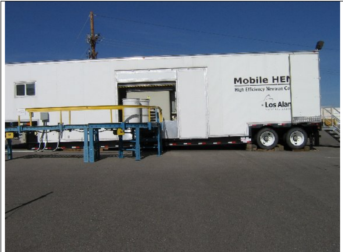
Figure 1: High Efficiency Neutron Counter at Los Alamos National Laboratory (HENC#2).