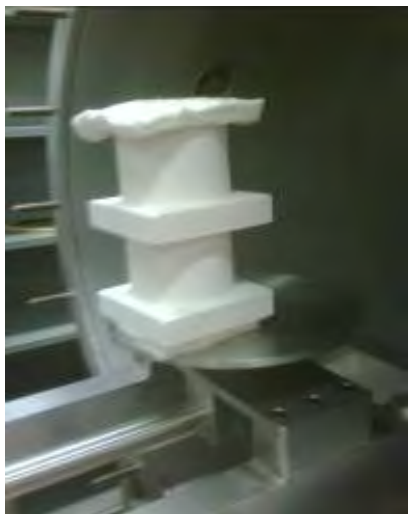
(a) Insulation setup

(cation, anion and mixed-bed) as well, to determine the VR resulting from total pyrolysis by microwave. Figure 2d illustrates such a run on cation resin at 900 °C. The resulting product is a pure carbon powder.