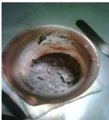
(d) Final resin product