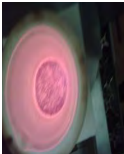
(b) Final temperature