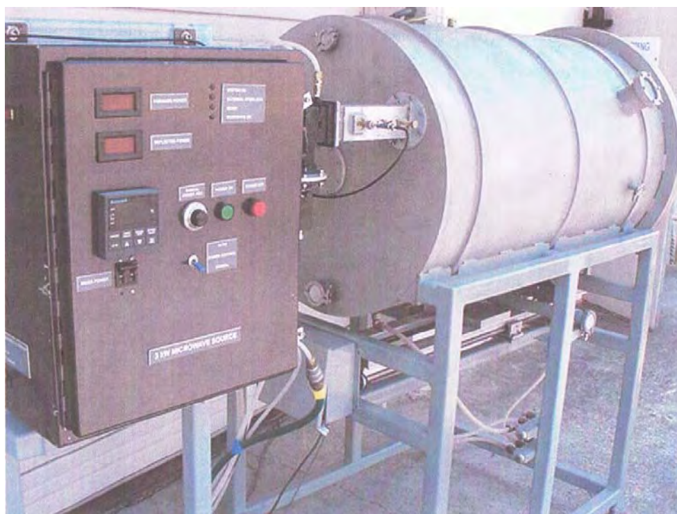
Figure 1. Pilot Advanced Microwave System (AMST TM )

The AMST TM consists of a 500 liter microwave vacuum vessel, a 3 kW microwave power supply with circulator, directional coupler with stub tuner, and microwave compatible vacuum chamber with rotating table. See Figure 1. 3 kW of microwave energy can be supplied to the system (220 V, 35 A, single phase) at 2450 MHz. Partial, or full vacuum, can be maintained on the system, or purge gas/instrument air can be utilized. Material melt temperatures are monitored, as well as controlled at the remote control panel, by both a K-type thermocouple (through the front port) and a infrared pyrometer (through the top-mounted germanium window). The waveguide, fed by the power supplies and the circulation water, consists of a circulator, directional coupler, four stub tuner and E-plane bend into the rear microwave window of the vacuum chamber. See Figure 1 for a photo of the pilot system.