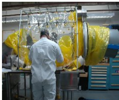
Figure 2. T Plant is currently running two mockup repackaging lines for training, allowing workers to gain practical experience in a controlled environment.

In addition, CHPRC worked with the training provider to develop a comprehensive safety and field work training program for the new workforce that included general training, facility-specific training (including mockups as shown in Figure 2), on-the-job training, hands-on mentoring processes, and gradual, focused integration with the workforce. Training schedules were examined and modified to provide block sessions for various disciplines and ensure critical skills were available to support both Recovery Act and ongoing projects. These training sessions were aimed first and foremost at indoctrinating our safety culture into all work activities. Skills targeted to receive block training included those for RCTs, Nuclear Chemical Operators (NCOs), Shippers, Waste Management representatives, and D&D workers. This process, while straining the available resources for implementation, provided a concentrated return on investment when the new workers were ready to deploy to job-specific activities and training in the field in only two short months. Once on Site, the new workers were further integrated into work teams comprising both experienced and new workers. The experienced workers became the mentors and day-to-day teachers of the new people providing the most valuable commodity – experience. This process provided qualified and certified workers on task in as little as three months. Under normal processes NCO training and qualification can take as long as one year.