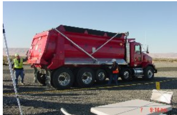
Figure 3. The “super dump” truck is an effective tool for transporting large volumes of waste from ARRA remediation activities to disposal.

Several enhancements are being implemented to provide efficient tools for managing increased volumes of wastes from accelerated cleanup on the Plateau. These include bigger, faster waste transportation tools such as very large containers to transport remote-handled large equipment items; the use of “super dump” trucks (see Figure 3) that allow increased volumes and efficiencies for on-site disposal; and increased rail shipments to off-site facilities using modified “beer can” express and “Super A” transport packages. The “super dump” is used as the