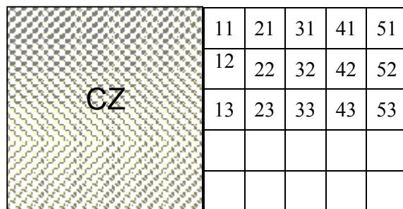
Fig. 2. Illustration of Unique Receptor Locations within a 100 m 2 Square Residence and with the Contamination Zone (CZ) Side-Gradient of the Residence