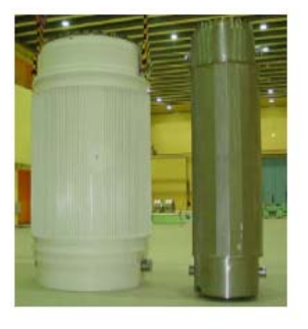
Fig. 1. TN<sup>TM</sup>24BH and TN<sup>TM</sup>9/4 metal casks in ZWILAG storage hall